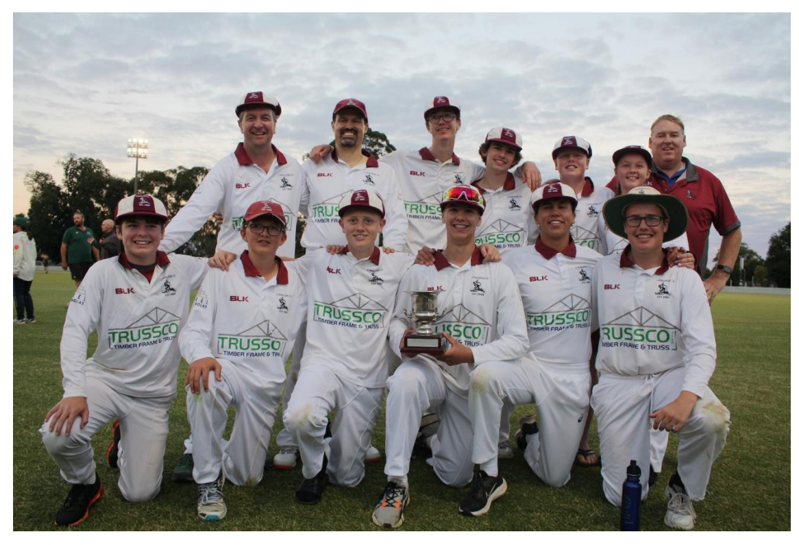
Premiers: Cavaliers CC

5 teams entered the Centenary Cup competition this season, with Cavaliers returning for the first time since 2016-17.