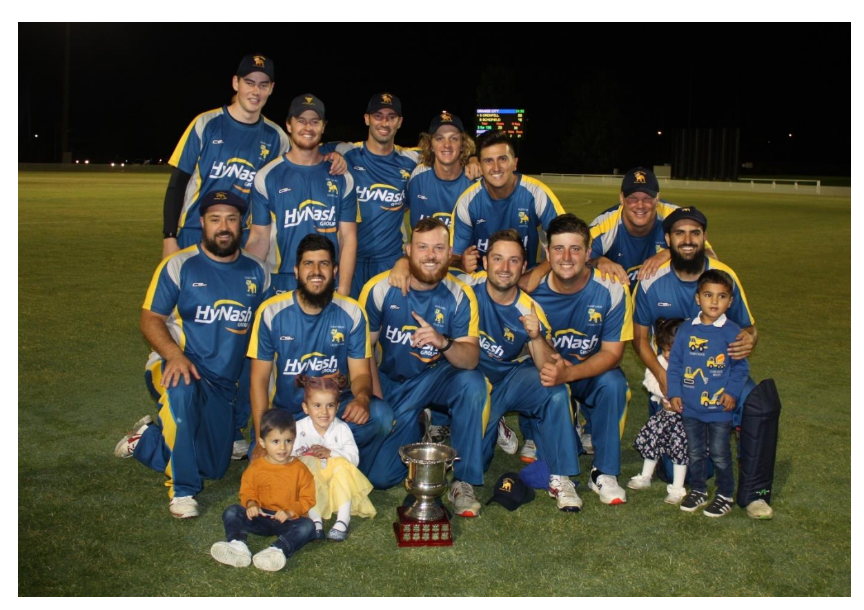
Winners: Rugby Union CC

Twelve teams contested the Royal Hotel Cup T20 competition this season with all BOIDC teams included for the first time ever. Teams were divided into 4 pools, playing 2 matches in their pool before the two highest placed teams progressed to the quarter finals.