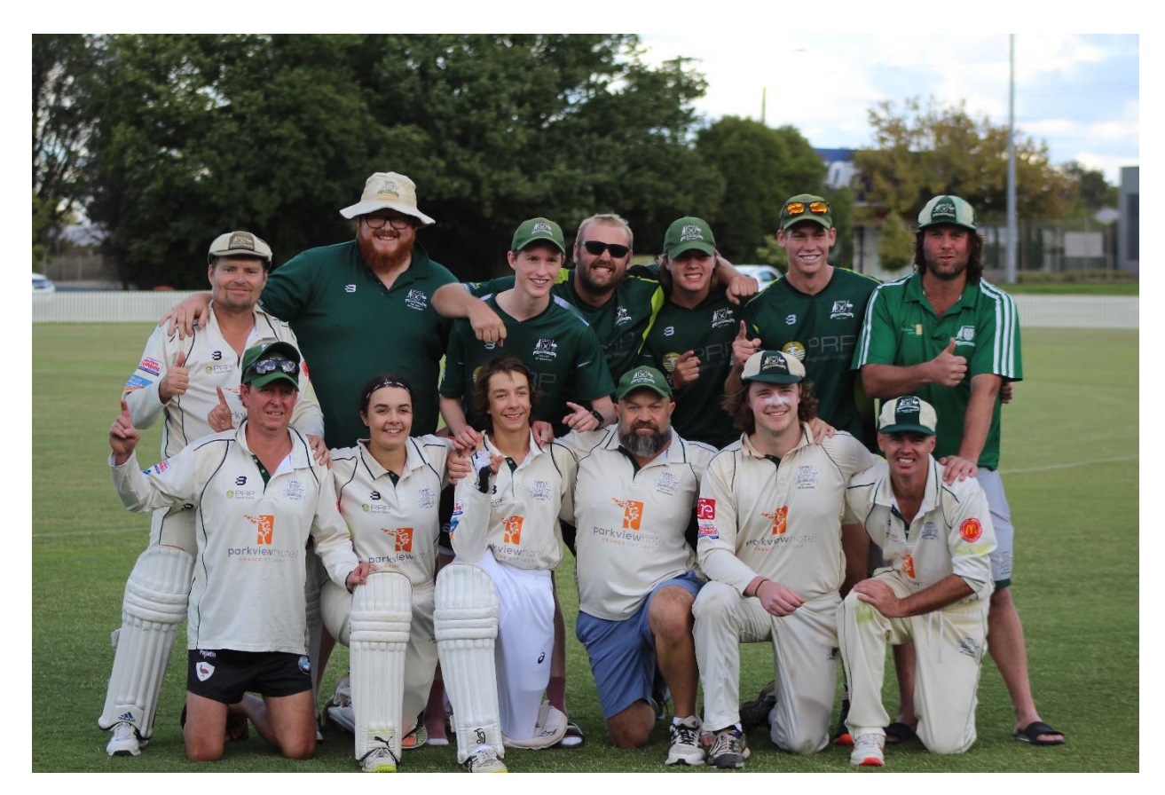
Premiers: Orange City CC

Six teams contested the Second Grade competition with the Committee permitting Centrals to enter 2 sides, largely to eliminate the bye after 7 teams were nominated in third grade. The competition also returned to only playing one day matches, with four rounds of 50 over matches scheduled for the Christmas holidays as well as the finals.