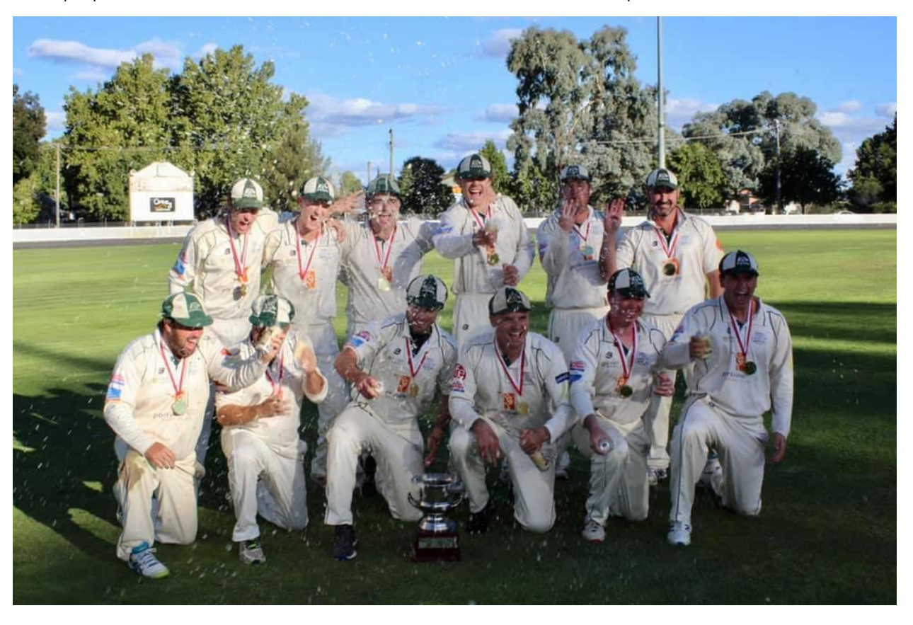
Winners: Orange City CC

A full wrap up of the BOIDC season is available in the BOIDC Annual Report.