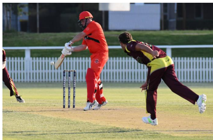
action from the Centrals v Cavaliers Pool B match

Cavaliers 5/128 (N Crowley 37 H Middleton 24 W Lummis 21; D Kennewell 2/25) def Centrals 4/127 (A Norton 47 G Judge 36 W Oldham 21*) by 5 wickets