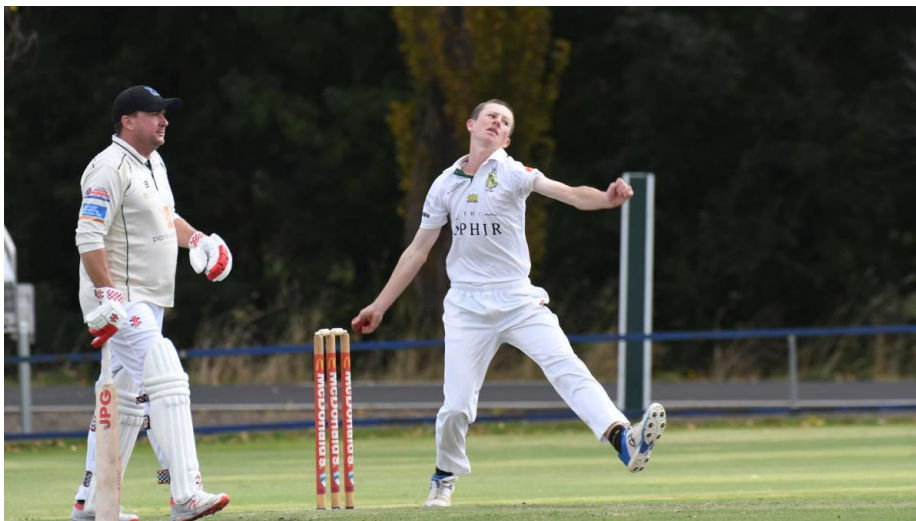
Third Grade grand final action