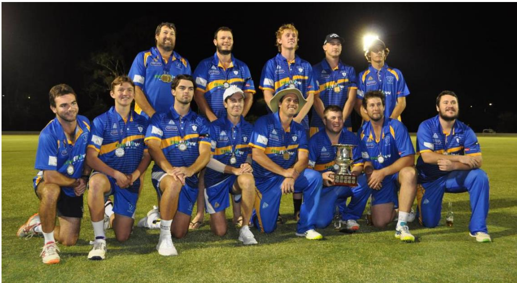
Royal Hotel Bonnor Cup winners: St Pat's Old Boys CC