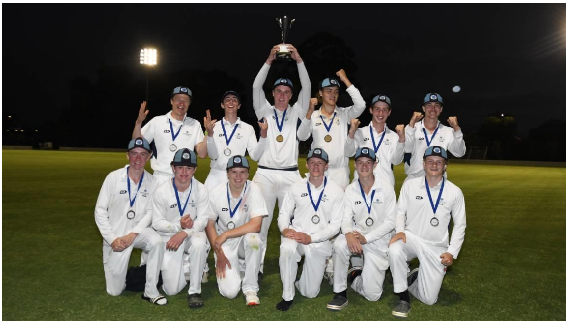
Second Grade Premiers: Kinross Wolaroi School CC

The 27-run win was the first time the Kinross First XI team had won a title since 2007.