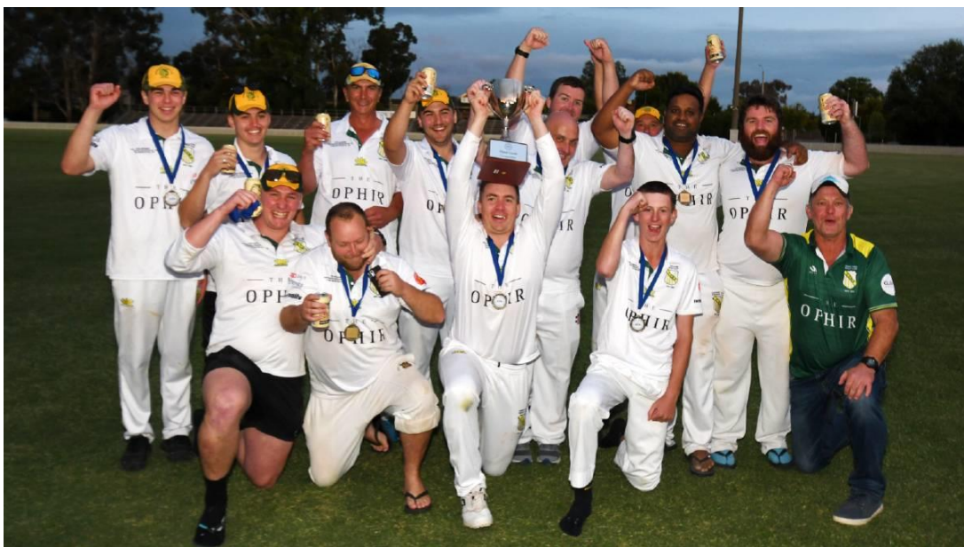
Third Grade Premiers: CYMS CC