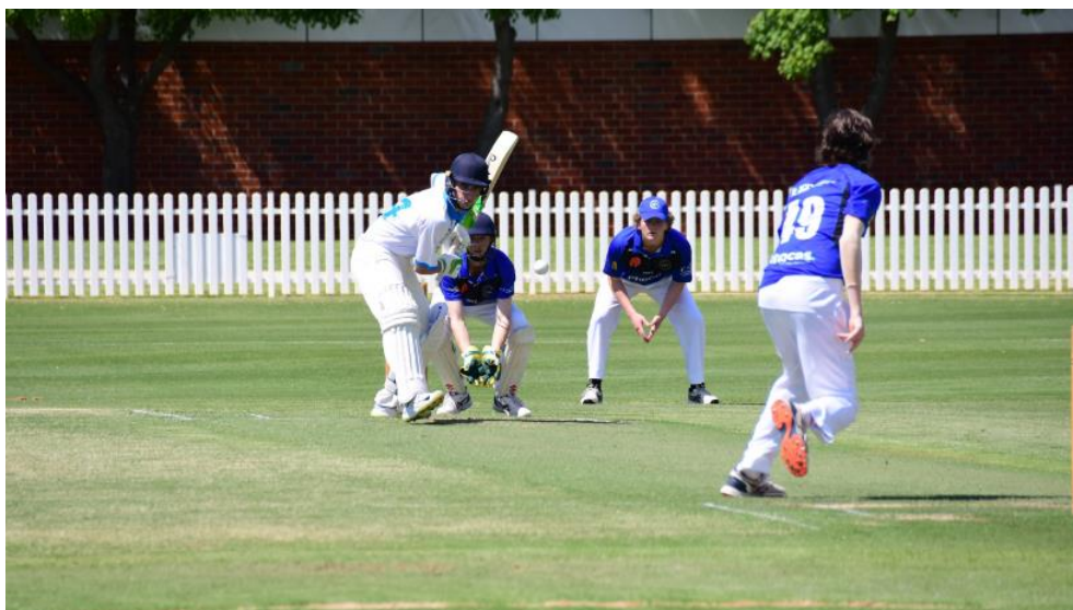
The Orange Colts team in action at the Western Zone carnival