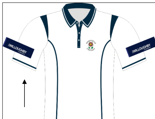
Figure 3 - Coloured collar = NOT permitted; piping or panels wider than 4mm = NOT permitted; coloured outer-facing V Neck = NOT permitted