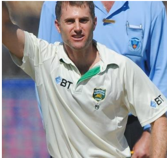
Figure 1 - Coloured V-Neck inner facing = Permitted