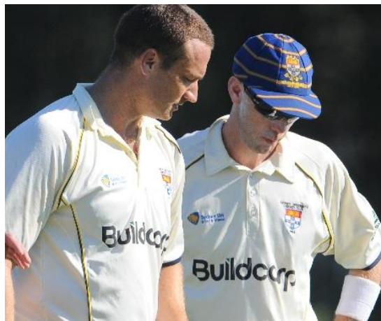
Figure 2 - coloured piping less than 4mm = permitted